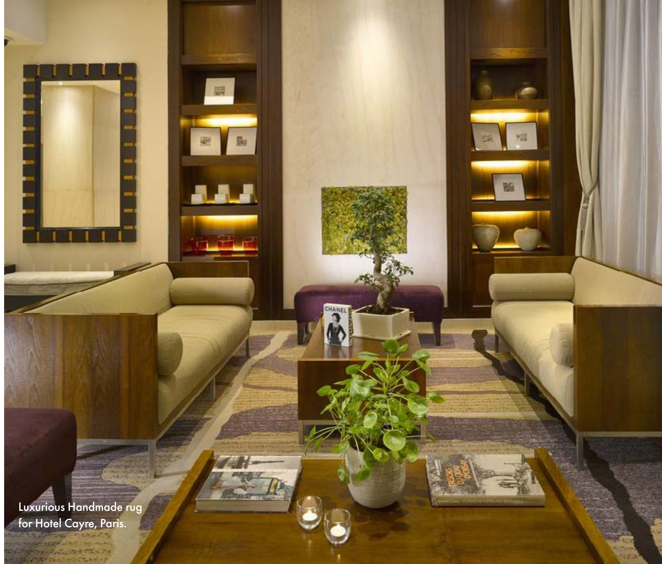
Luxurious Handmade rug for Hotel Cayre, Paris.

Numerous residential projects in London, UAE, Germany and USA.